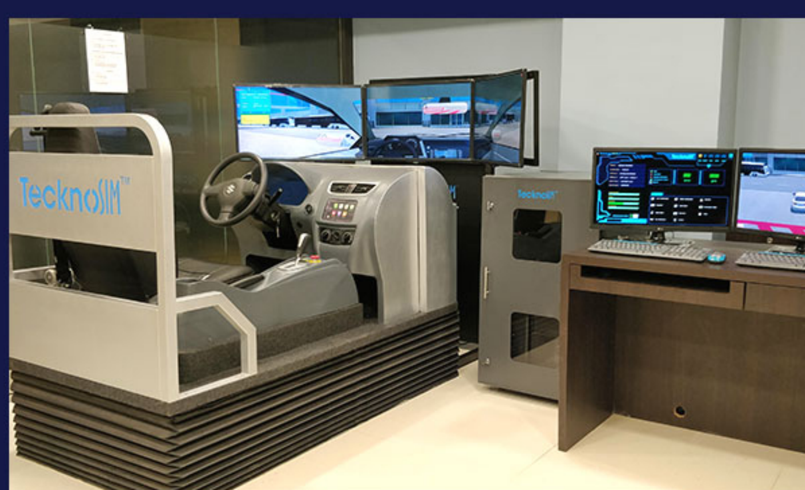
02 Simulator based onsite driver training