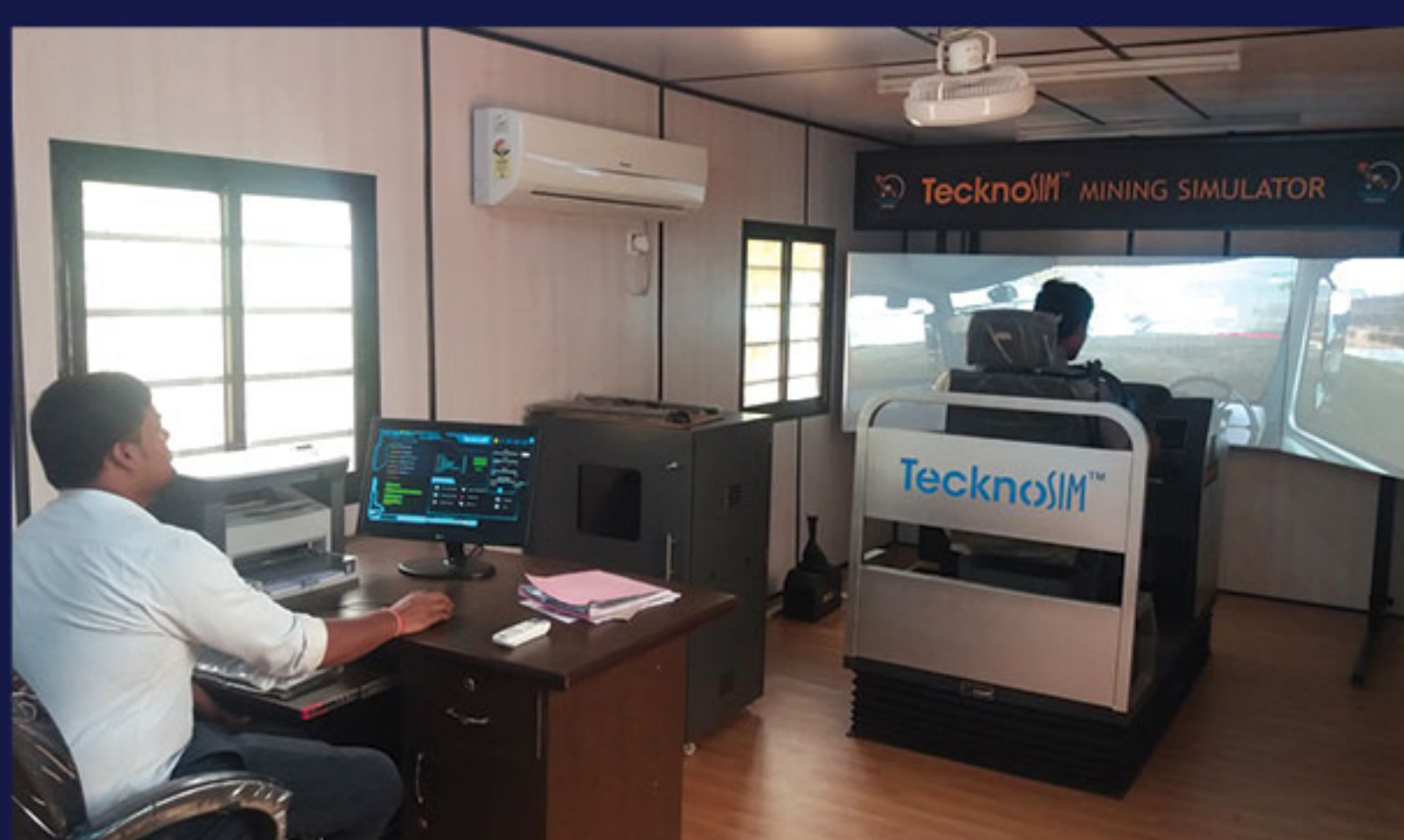
04 Driver operation and management services (DMC)