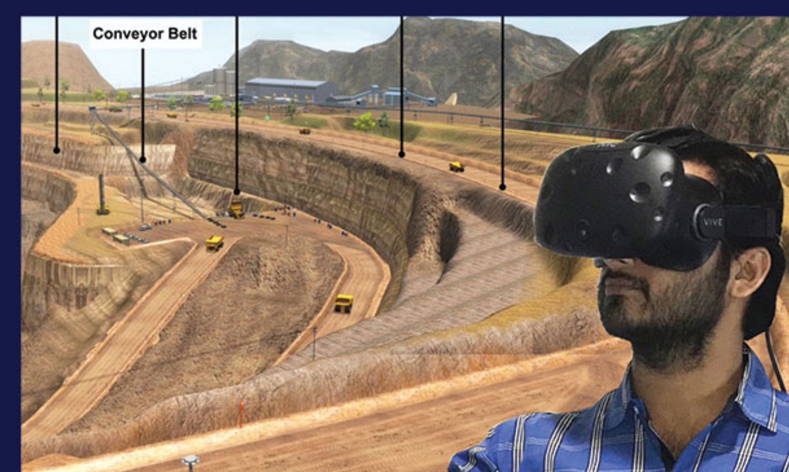
03 VR training programs (Customized)