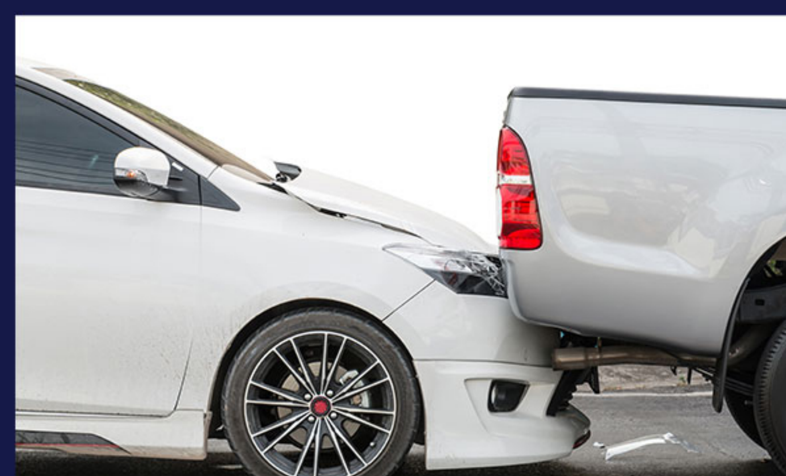
05 Accident prevention training