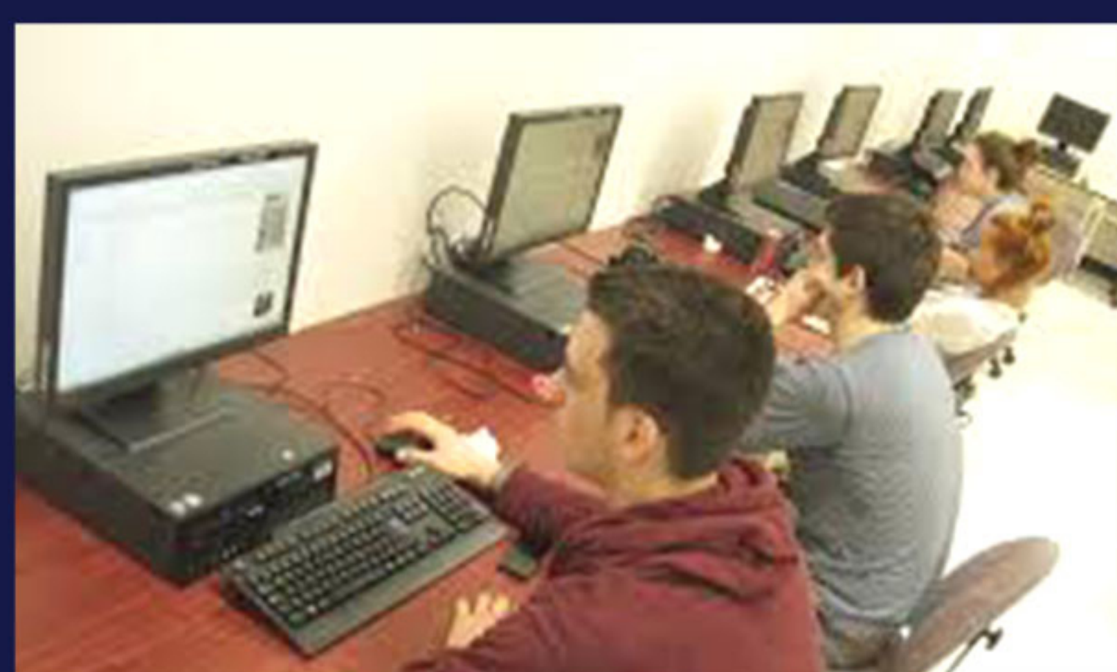
01 Online driver training programs