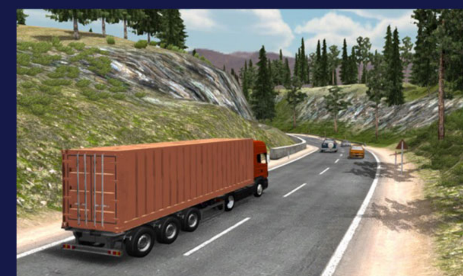
06 Hazchem driver training